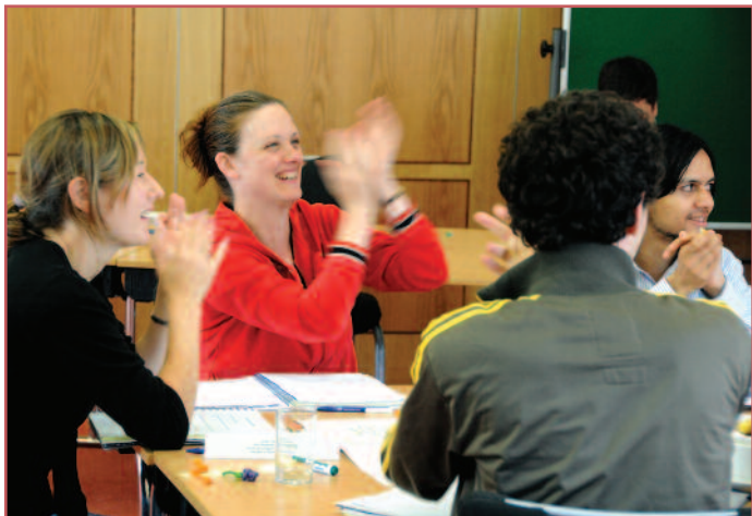
Informative and good fun.

Note: Please ensure that your application form is signed by your division secretary.